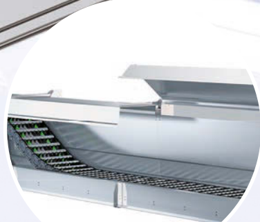
System channel and maintenance-friendly housing in galvanized or stainless steel