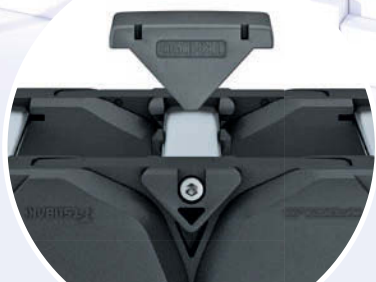
Replaceable glide shoes