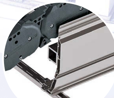
Aluminum guide channel with gliding support