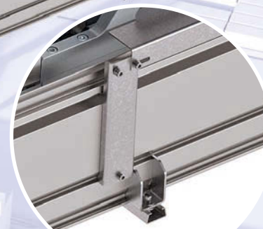
Mounting kits external and internal