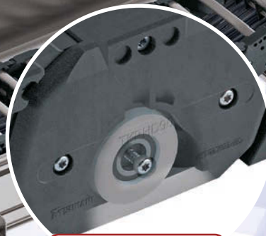
Cable carrier with integrated roller