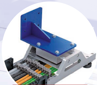
Floating moving device